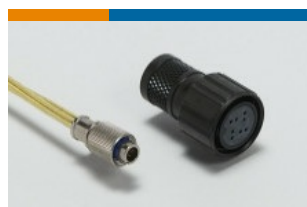
Standard Circular Connectors (177)