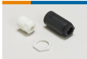
Circular Connector Locking & Retention (1)