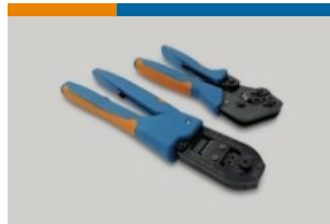
Hand Tools (9)