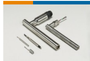
Linear Position Sensors - LVDT/LVIT (1)