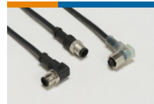
Sensor Cable Assemblies (222)